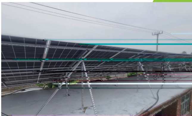
Figure 2. The project picture

In total, 30 pieces of bifacial modules of two different technologies TOPCon and PERC were installed in two fixed arrays at a tilt angle of 25°, and each bifacial module contains 144 pieces of the half-cut cell (182" size). Moreover, the height of the supporting system was 0.4 meter. The ground was painted white to acquire accurate results since bifacial modules are sensitive to the surroundings. The PASAN Sun simulator measured the front and rear sides' electrical characteristics. The bifaciality and the low light efficiency at 200W/m 2 were also measured and calculated. The outdoor energy generation was measured by GCI-36K-5G inverter in a 5-min interval. The energy yield performance of TOPCon, and PERC bifacial PV were revealed and systematically compared.